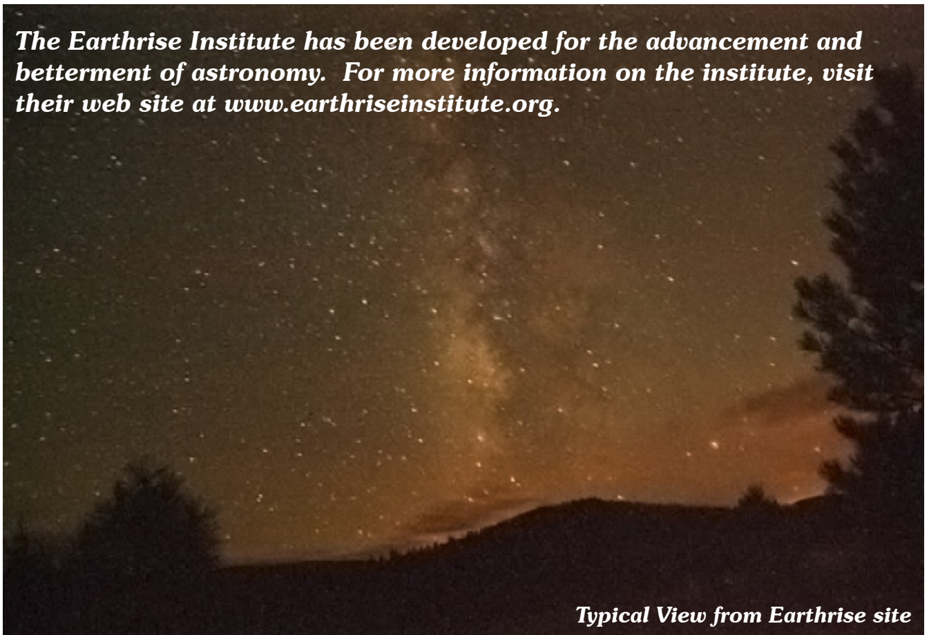
Typical View from Earthrise site

The Earthrise Institute has been developed for the advancement and betterment of astronomy. For more information on the institute, visit their web site at www.earthriseinstitute.org .